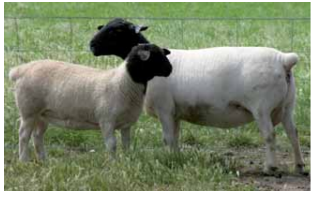
Dorper Ewe and Lamb.